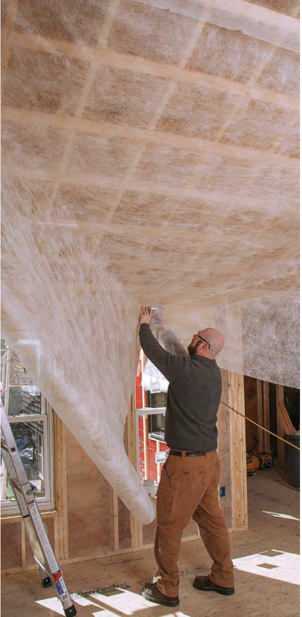
Drape and pull. Ceiling cavities are tackled much the same as walls. The netting is fastened to the ridge and allowed to hang down, then pulled tight and fastened along the bottoms of the rafters before lip-stitching.