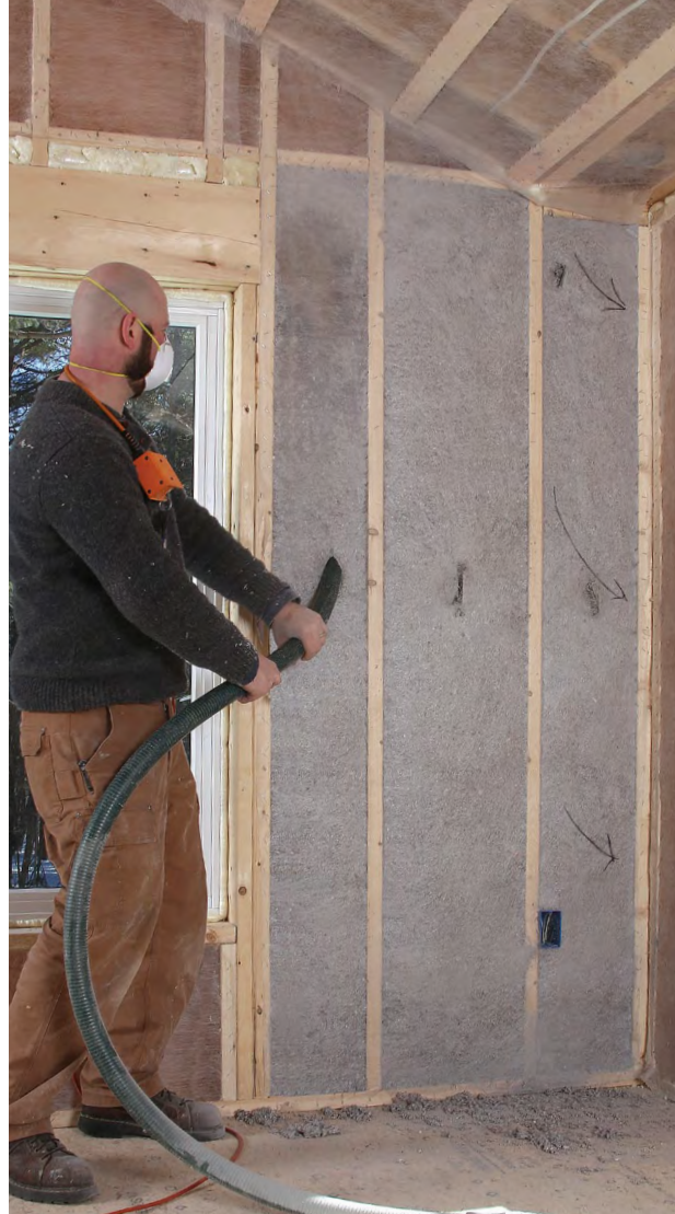
... and then from the top down. With the reinserted whip pushed to the top plate, the cavity is then filled from the top down. As the cavity fills, the whip is backed out and withdrawn. Installed correctly, the cellulose is packed tight enough that patching the hole is unnecessary.

ering). Stapling the corners is important. This step, described by cellulose installers as lip-stitching , puts continuous lines of staples on the stud or framing corners. These lines of staples contain the intense pressure of the blower and allow the netting to bulge slightly in the center without stretching too far beyond the stud faces. If the insulation bows beyond the framing, it interferes with drywall installation, so we use a special roller to flatten the filled cavities. Lip-stitching controls the bulge enough so we don't have to remove excess material.