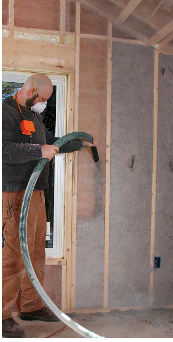
Fill from the bottom up ... In an 8-ft. or 9-ft. stud cavity, the whip is inserted near the middle and pushed all the way to the bottom plate. As the cavity fills, the whip is slowly withdrawn. When the cavity is half filled, the whip is removed.

Once the netting is in place, the cavities are filled one at a time using a 6-ft.-long, 1<sup>1</sup>/<sub>2</sub>-in.-dia. or 2-in.-dia. tube called a whip. The tube's sharpened end is pushed through the taut netting toward the far end of the cavity, extended all the way in, and then slowly withdrawn as the cavity is filled.