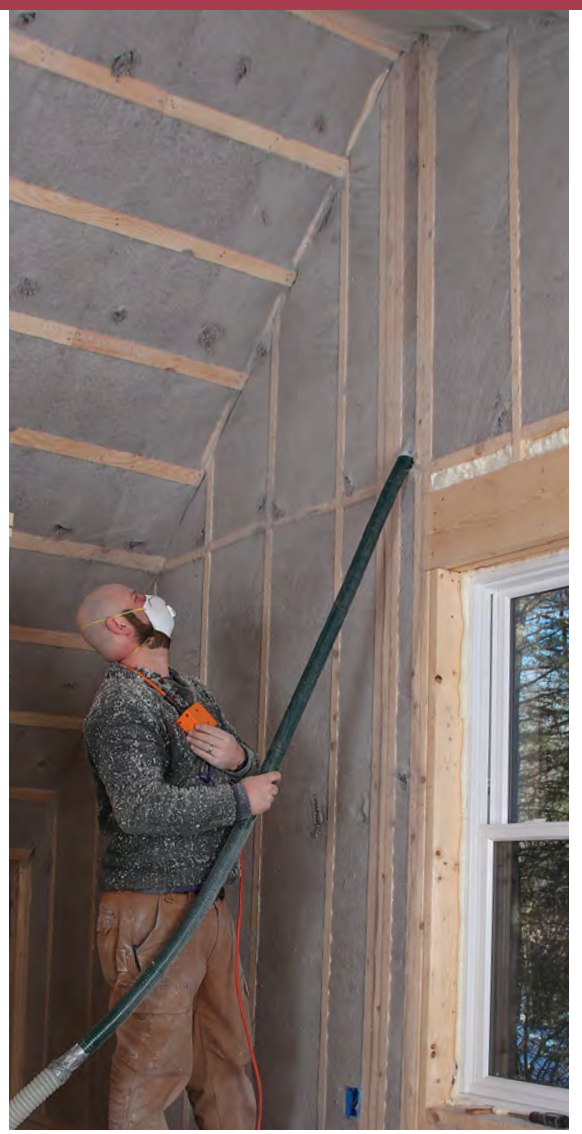
Beware of blind spots. Odd-shaped and hidden cavities are marked with a Sharpie during the netting stage so the insulator remembers to fill these spaces. Blind corners created by adjoining walls are best filled through multiple holes spaced a couple of feet apart, with the hose plunged horizontally into the hidden part of the cavity. Cavities smaller than 2 in. are filled with canned spray foam.