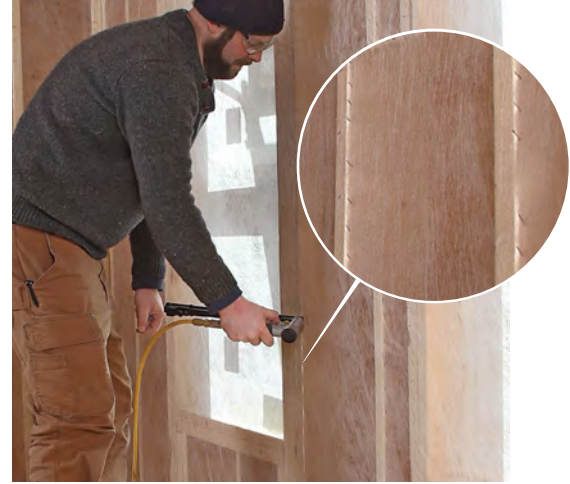
Lip-stitch the studs. Once the netting is facestapled around the assembly perimeter, it's stapled to both front corners of the studs or framing members with staples placed about 1 in. apart. This method, called lip-stitching, draws the netting even tighter across the cavity to help prevent bulging.