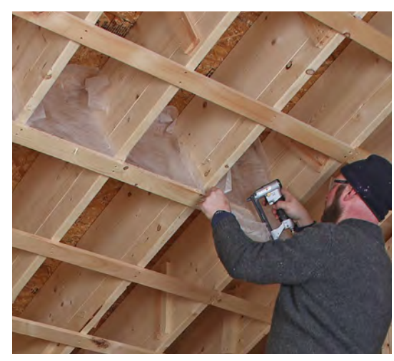
Divide deep cavities. Cavities deeper than 12 in. should be divided into cells using small pieces of netting spaced about 6 ft. o.c. The smaller space makes it easier to reach all corners, ensuring the cellulose is installed at the correct 3<sup>1</sup>/<sub>2</sub>-lb.- to 4-lb.-per-cu.-ft. density.

Cut small pieces on the floor. Precision isn't critical for the small pieces of netting used to divide cavities, but using a measured piece as a template helps speed the work of cutting a stack of the small rectangles needed to divide the 16-in.-deep rafter cavities.