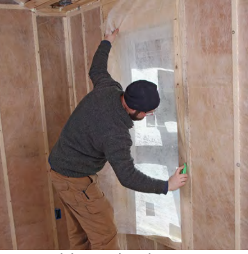
Trim around doors and windows. Excess netting is trimmed along the bottom plate and around the perimeter of framed openings where it covers doors and windows. The nonwoven material cuts easily with a fresh blade.

The Perfect Insulation," FHB #268). And unlike the VOC-heavy spray-foam process, which requires that the work site be completely evacuated, homeowners can live their lives and work can continue while we dense-pack. Dense-pack cellulose can also be installed in freezing temperatures without the expense of temporary heat.