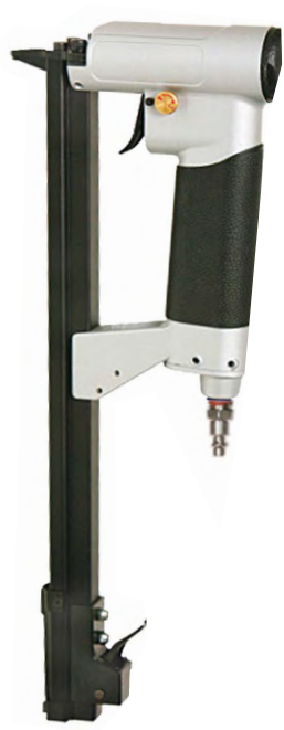
Installing cellulose netting requires driving thousands of staples. For this work, pros use an adjustable-speed autofire upholstery stapler. The tool shown here, a Spotnails A-11 series stapler (about $150), can hold 168 staples in its extra-long magazine.

blow so we can double-check the density of the assemblies we insulate. We use the manufacturer's coverage chart (visit finehomebuilding .com/magazine) to calculate how many bags it takes to achieve the correct density. The thicker the framing, the denser the cellulose will need to be in order to be self-supporting. In general, one 25-lb. bag of cellulose will cover approximately 15 sq. ft. of 2x6 wall at 3.5 lb. per cu. ft. or 6 sq. ft. of 2x12 rafters at 3.8 lb. per cu. ft.